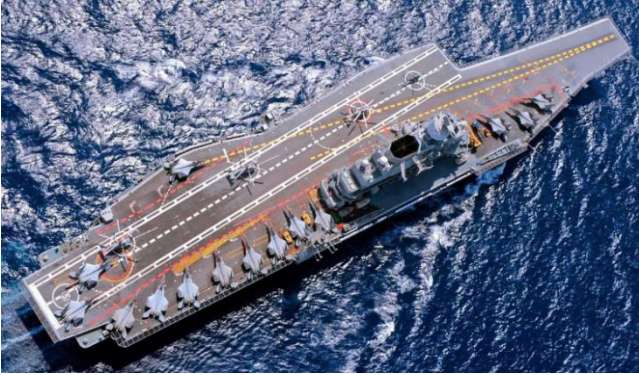
Fig.3: Top view of Loaded Aircraft carrier INS Vikrant