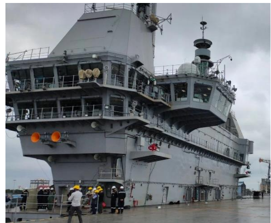
Fig.2: 14 Decks Massive INS Vikrant Onboard