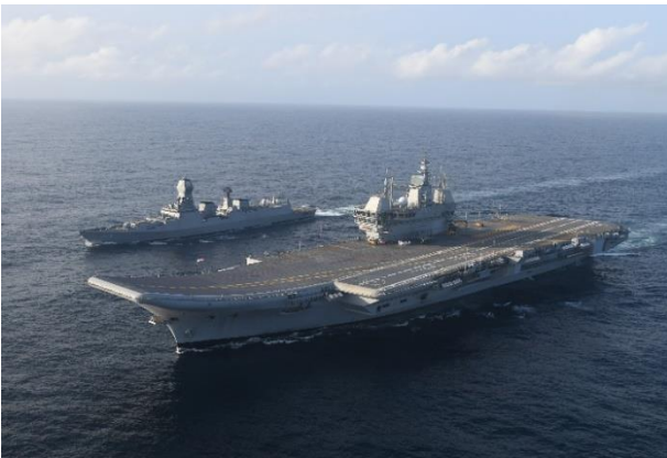
Fig.1: Long View Photo of INS Vikrant Sailing

The Design and Development of INS Vikrant has demonstrated the capabilities available for not only design but to produce with international standards totally indigenously. Further, this also has strengthened the Indian Navy's strength and demonstrated the "Atmanirbhar Bharat" in the vital segment of Naval forces.